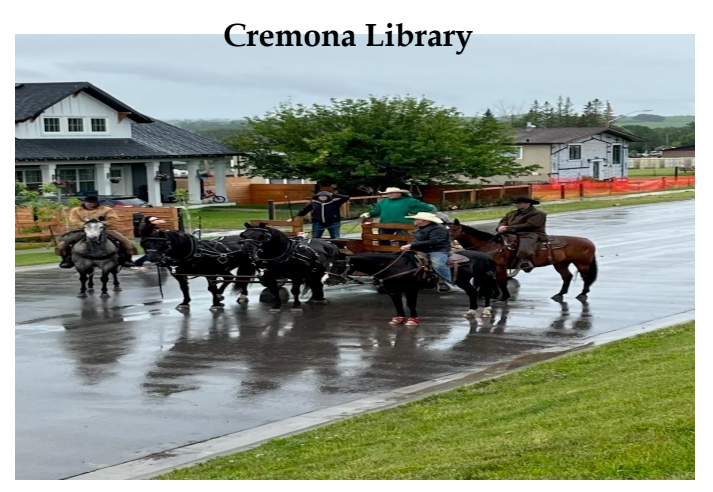
1st place Award Western Flare